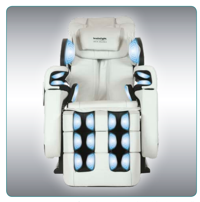
Air pressure massage for various areas, selectable individually or in combination